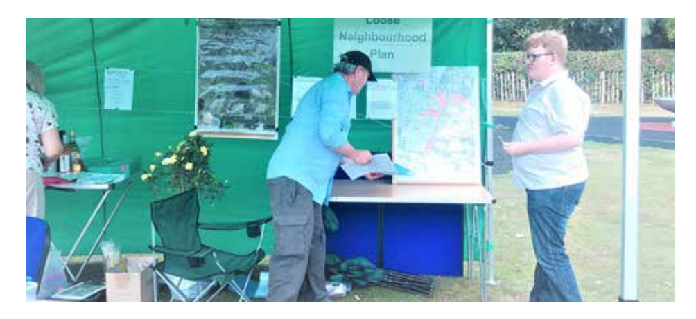
Parish Fête 2016

Considerable interest was shown in the draft pre-submission plan which was put out for consideration. The focus of the display was to alert stakeholders about how and where they would be able to make their comments when the pre-submission draft was launched into the parish and the importance of these comments. Again, the dot map was utilised. It was now widely covered with dots across the whole parish.