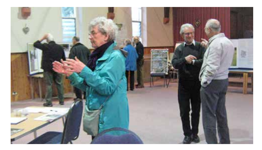
Three Day Exhibition — December 2015