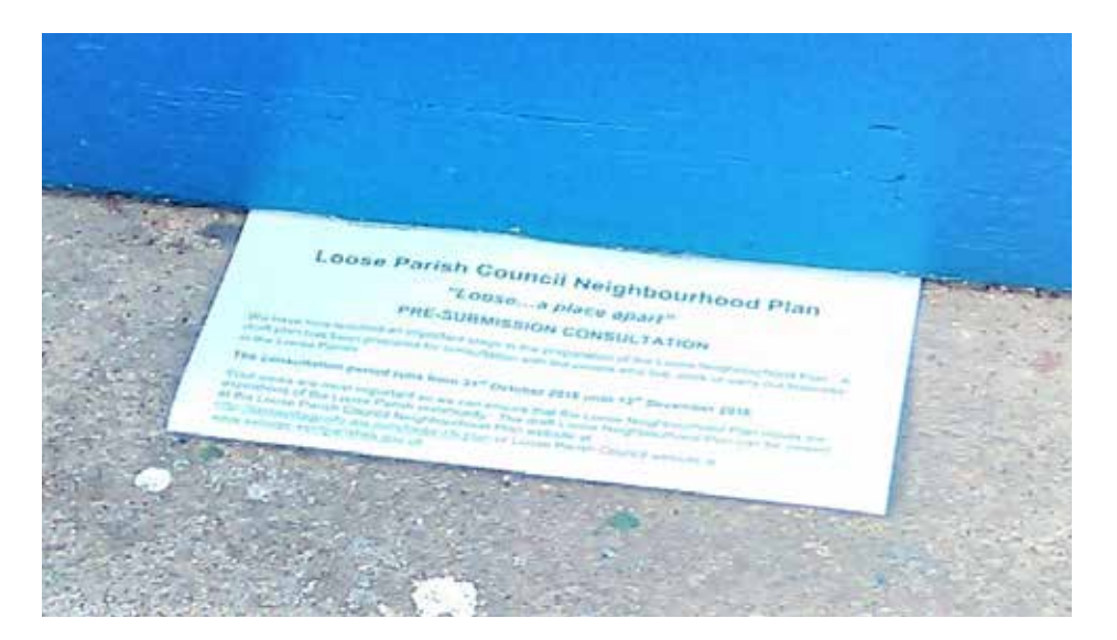
Pre-Submission Consultation 2016