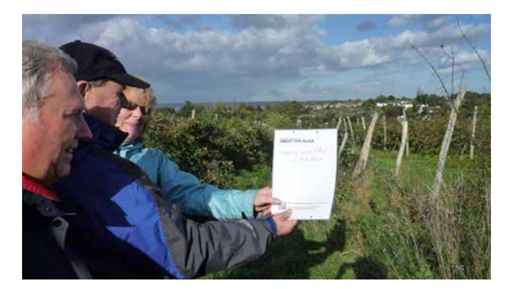
Three-Day Design Forum — October 2014