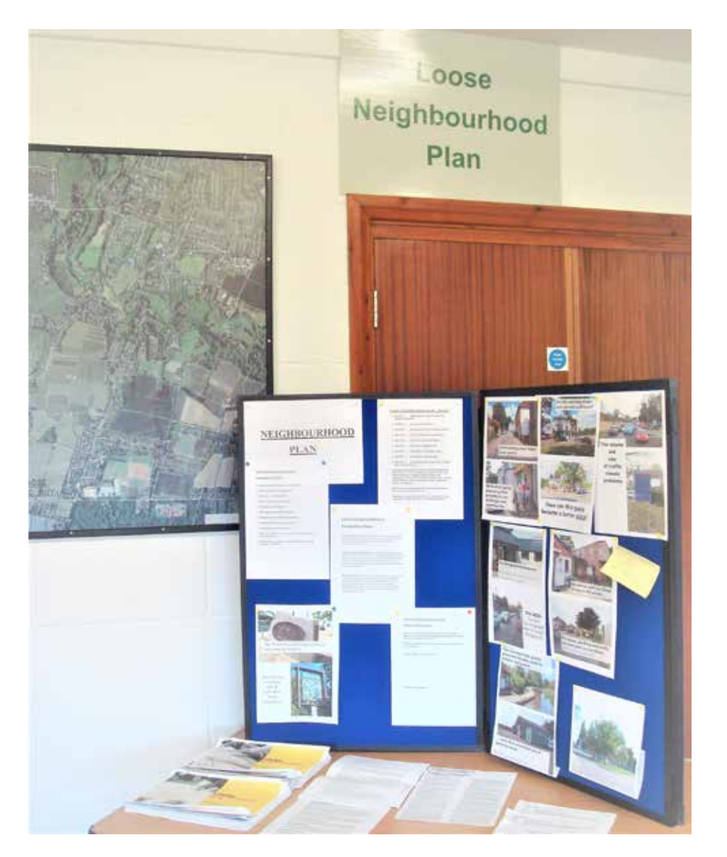
Annual Parish Meeting — April 2015