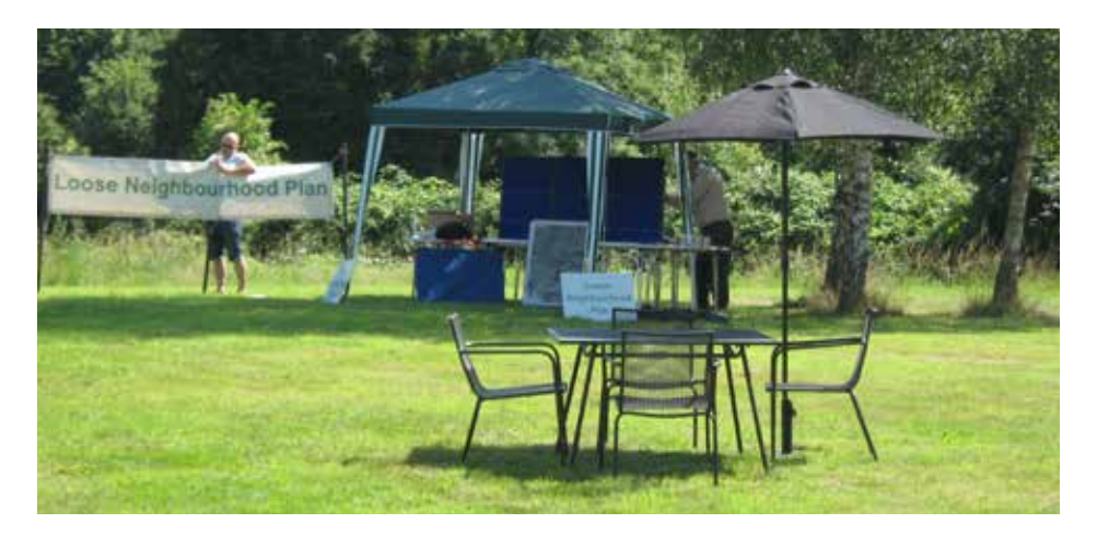
Loose Valley Care Centre Open Day — August 2015

On the 22<sup>nd</sup> August representatives from the Steering Group attended the Loose Valley Care Centre Open Day. A manned poster display about the plan was set up. The event mainly consisted of dialogue between the representatives, the public and staff rather than with the residents of the home.